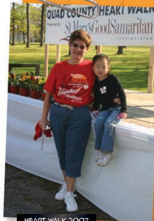
HEART WALK 2007

WE'RE CHAMPIONS OF ORGANIZATIONS SUCH AS THE UNITED WAY, THE AMERICAN RED CROSS, THE AMERICAN CANCER SOCIETY, AND THE AMERICAN HEART ASSOCIATION, JUST TO NAME A FEW. NOT COUNTING THE FUNDRAISING OUR EMPLOYEES DID, ST. MARY'S GOOD SAMARITAN DONATED OVER $30,000 TO THE AFOREMENTIONED ORGANIZATIONS.