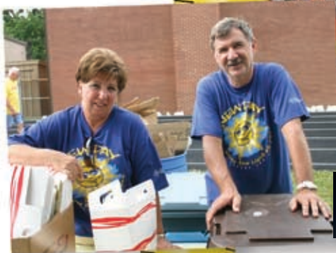
HOSTING THE SURVIVOR'S TENT AT RELAY FOR LIFE IN MARION COUNTY AND JEFFERSON COUNTY.

THE WORK WE DO AT ST. MARY'S GOOD SAMARITAN GOES FAR BEYOND THE WALLS OF OUR FACILITIES...OUR SUPPORT OF CHARITABLE ORGANIZATIONS IN OUR COMMUNITY ENSURES THAT THE MISSION GOES ON AND ON, AND THAT PEOPLE CAN GET THE HELP THEY NEED.